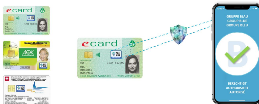
Figure 2: Authentication via Authentic Vision App

The app can either be integrated into an existing mobile application or published as a stand-alone app in the customer's design. The message that is displayed after successful authentication can be customized , with information from health authorities and concrete recommendations for action.