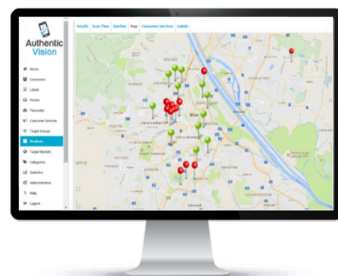
Figure 3: Overview of location data in the Authentic Vision Web Portal

This process is 100% data protection compliant (GDPR compliant), as the connection between a person and their classification or test result is limited to the physical connection between the tag and the respective ID document. At no time is personal information stored in the label system. Only the rating or test results are stored.